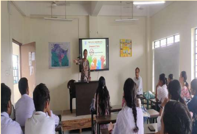
Anti Ragging - Department of History