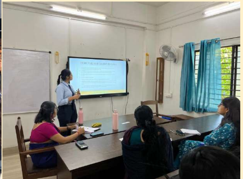
Students Centric Seminar s - Department of Geography