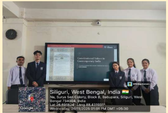
Constitution Day - Department of Political Science