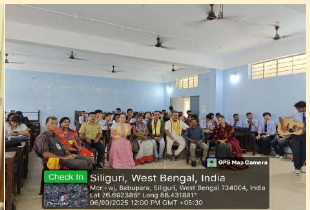
Teachers Day - Department of Commerce