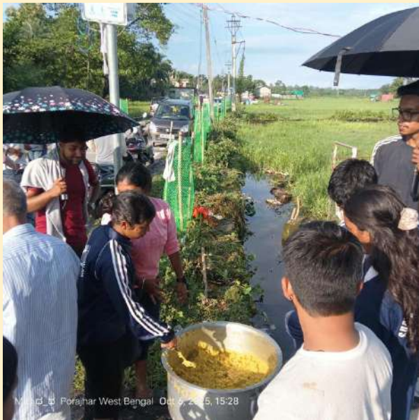
NSS Outdoor Activity