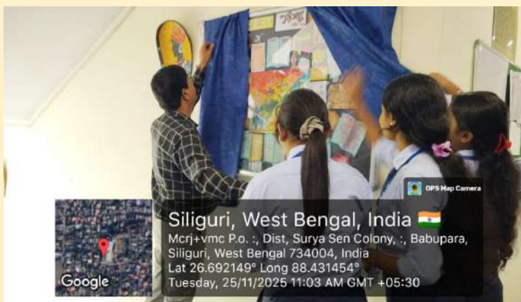
Wall Magazine - Department of Bengali